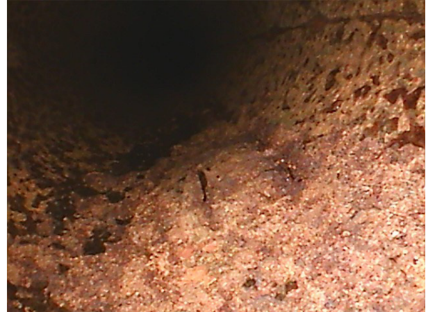
Visual inspection result

NFA probes significantly increases the productivity of inspections.